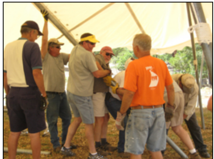
Shamrock Festival Tent Raising

On the weekend of August 25 - 27, members of St. Patrick's participated in the Equestrian Special Olympics hosted by LASSO, Pagosa's horse rescue. Eleven athletes enjoyed three days of riding and friendship. LASSO is grateful for all the support given by church members throughout the year.