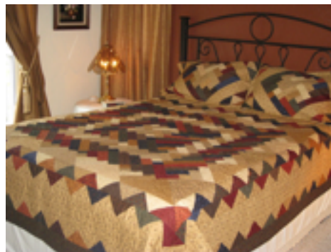
2011 Shamrock Festival Raffle Quilt